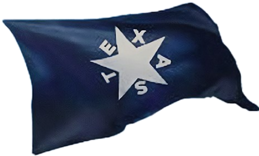
The First Flag of the Republic of Texas