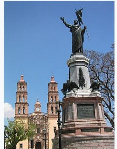
A statue of Miguel Hidalgo y Costilla in front of the church in Dolores Hidalgo, Guanajuato